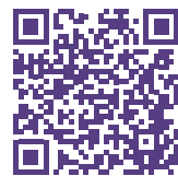
Delta Dental Kids Corner