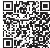
Find a Dentist